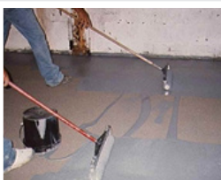
EPIKOTE SF200 primer