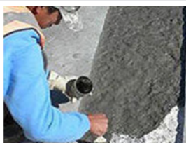
EPIKOTE SF200 for repair mortar