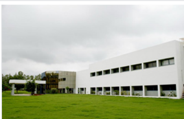
Dr. Reddy's, Bachupally, Andhra Pradesh, India