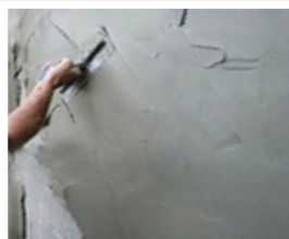
INTONACO Smooth application