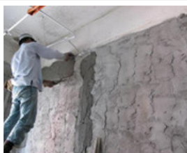
INTONACO Rough application