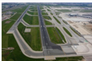
Runways and Taxiways