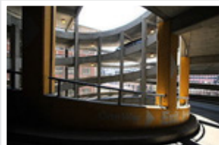
Parking garage Structures