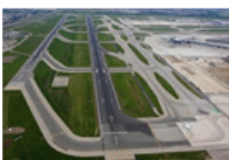
Airport Runways and Taxiways