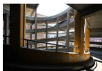
Parking garage Structures