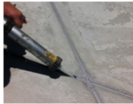
Placing SILIGEL for concrete joints