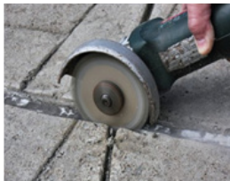
Saw cut before placing SILIGEL