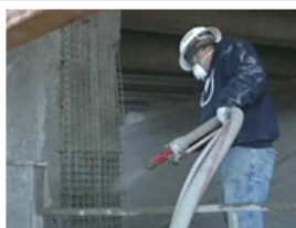
PCI 200 additive in sprayed mortar