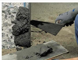
PCI 200 additive in polymer mortar