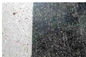
TECHNOCLIN on exposed grain