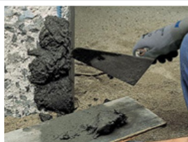
PCI 200 additive in polymer mortar