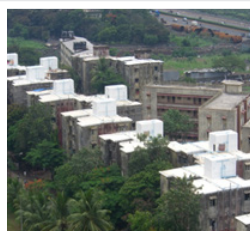
Railway Quarters, Ghatkopar Mumbai