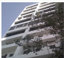
Urmi Aangan, Pedder Road, Mumbai