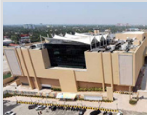
Lulu Mall, Cochin